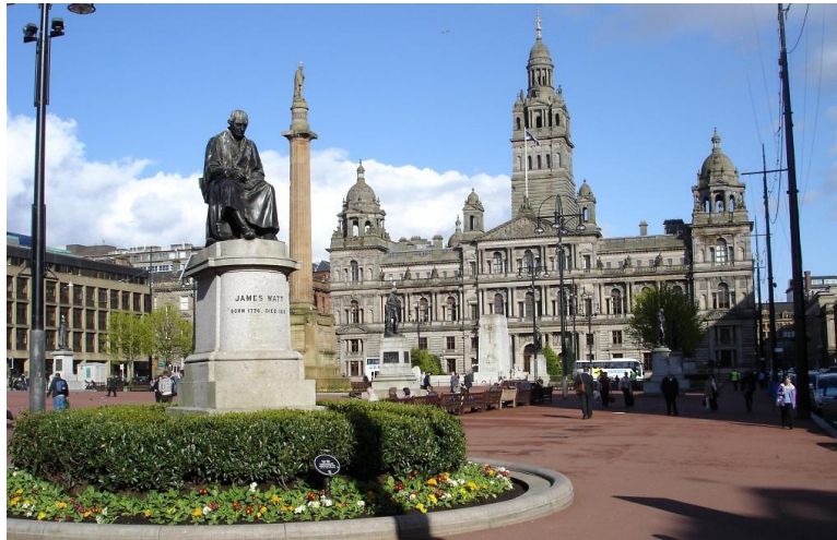
George Square, Glasgow and the statue of James Watt

The focus will be on Blame. All contributions will be more than welcome! They certainly do not have to be about our focus subject. The more topics on offer the better! Write a letter to the Editor, get something off your chest, or offer - perhaps the most valuable and important element in our fellowship - a share. And, as usual, I will ask specific groups to take their turn to contribute - using the alphabetical system, starting with the first and last in the alphabet and two groups in the middle. My calculations make this, for the Summer issue: Brighton, Harrow, Shard End, Glasgow (Tues.). If you can't think what to write about, I'll give you some suggestions. Together, we can work it out!