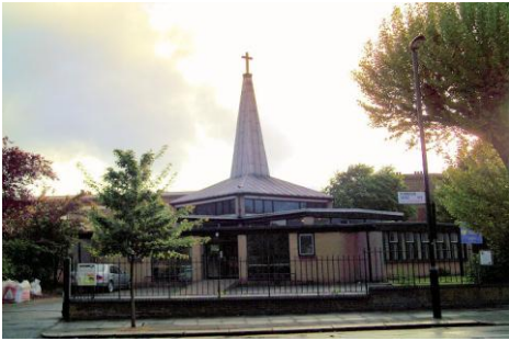
St Luke's Church

A long-standing member of the Queen's Park Group explained, before actually making the arrangements, that the group felt passionately about staging this event as an important aspect of twelfth step work. And so it was decided to host the Mini-Convention at St Luke's Church, London W9 on 24 November 2012 with the theme 'Tools of Recovery'. In advance, contact was made with NHS-run drug facilities in surrounding boroughs. The